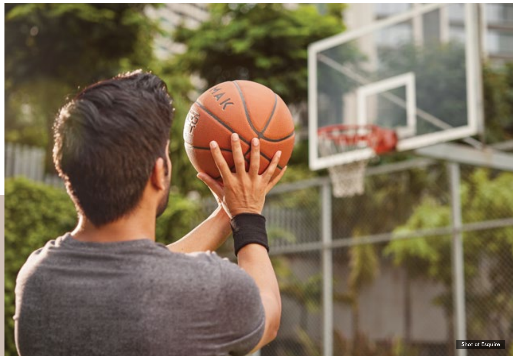
Shot at Esquire

Day Care * | Convenience Store * | Salon * | Launderette * Doctor's Room / First Aid Room * Indoor Multipurpose Hall ** | Café Lounge ***