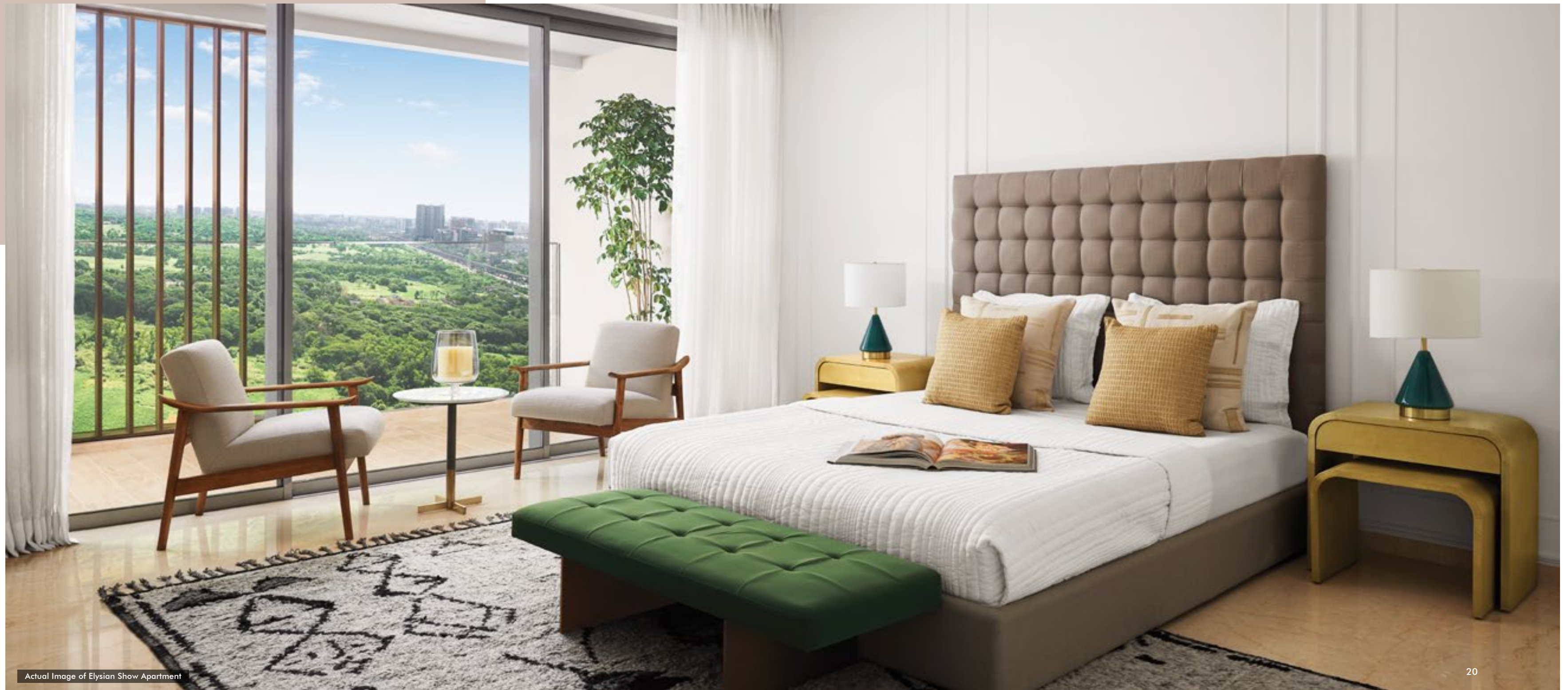
Actual Image of Elysian Show Apartment

At Elysian, luxury stands for spacious rooms, attention to detail and rooms that provide you with a canvas to create innumerable memories.