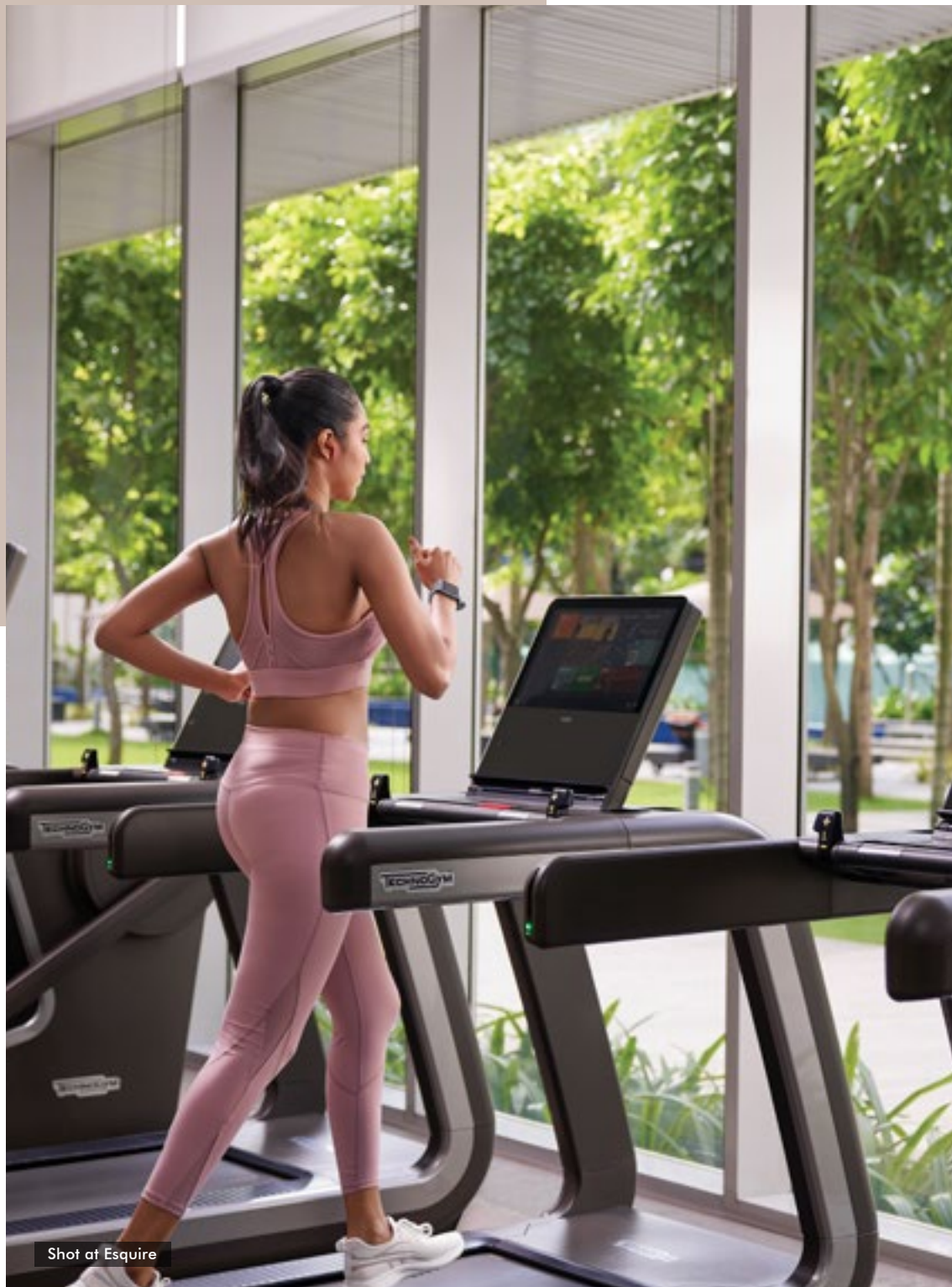
Shot at Esquire

* Space will be provided for the following common areas, facilities and amenities. These will be run by third party on chargeable basis. ** Amenities will be made available to all allottees of Elysian and the Reservation/Other Users Building/s Component. *** Space will be provided for the following common areas, facilities and amenities. These will be run by third party on chargeable basis, and will be made available to allottees of Elysian and the Reservation/Other Users Building/s Component.