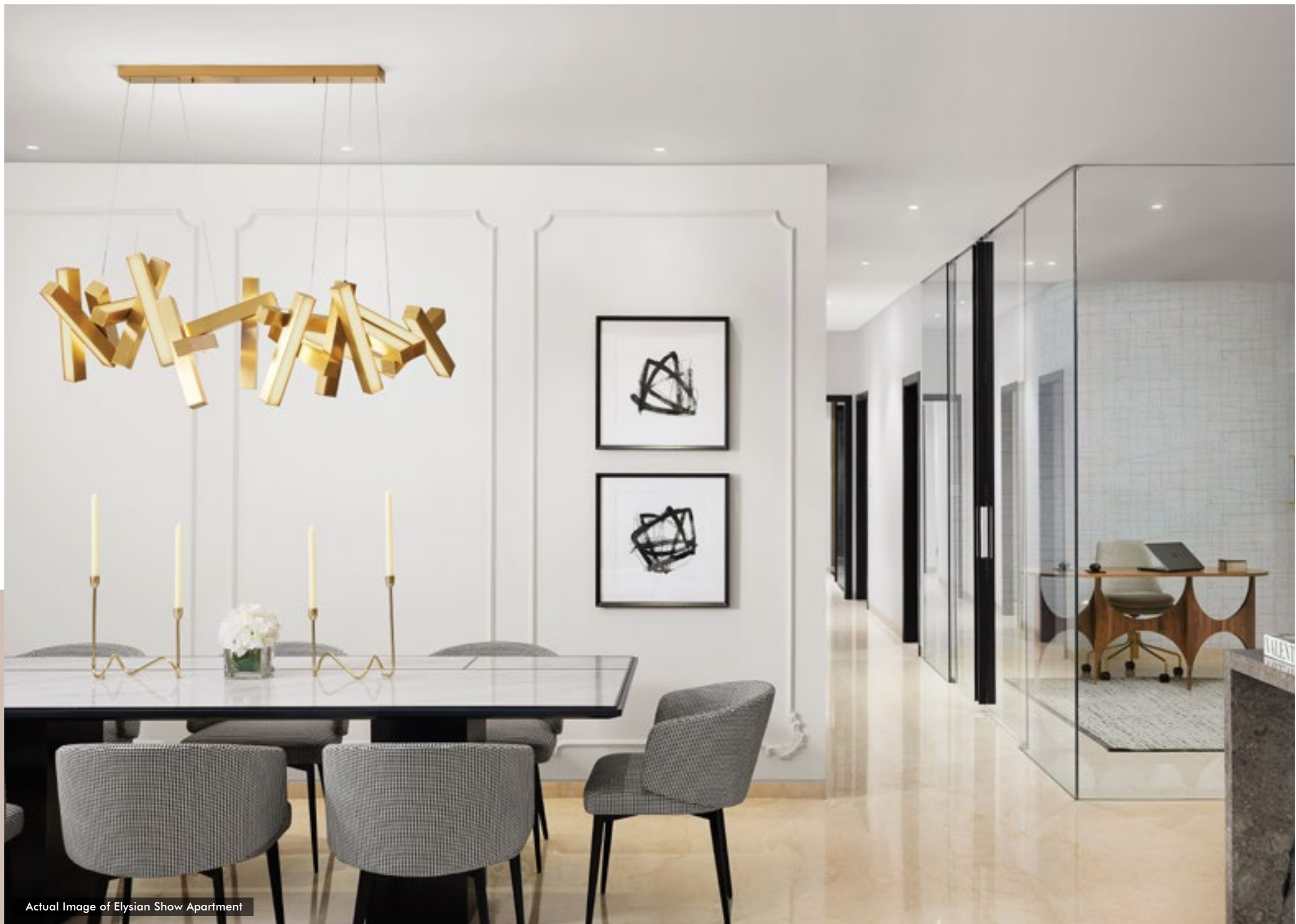
Actual Image of Elysian Show Apartment

At Elysian, every step exudes grandeur, every experience is beautiful. Your moments come alive. Your life is wrapped in luxury.