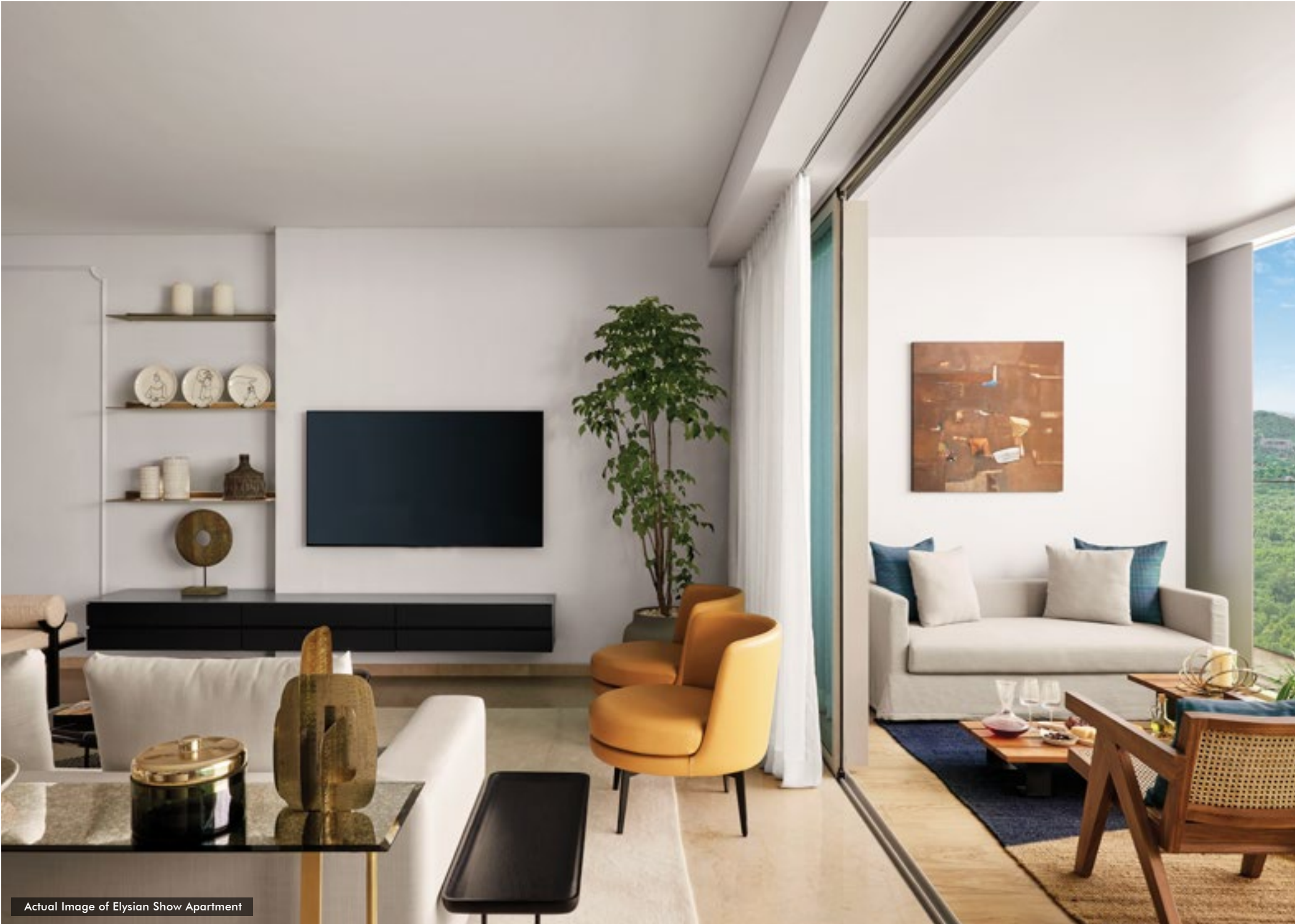
Actual Image of Elysian Show Apartment

An epitome of luxury, Elysian has been designed to meet the evolving needs of an urban lifestyle in a ready-to-move-in ecosystem, Oberoi Garden City. Elysian comes with spacious 3 and 4 bedrooms, and an endless list of worldly amenities.