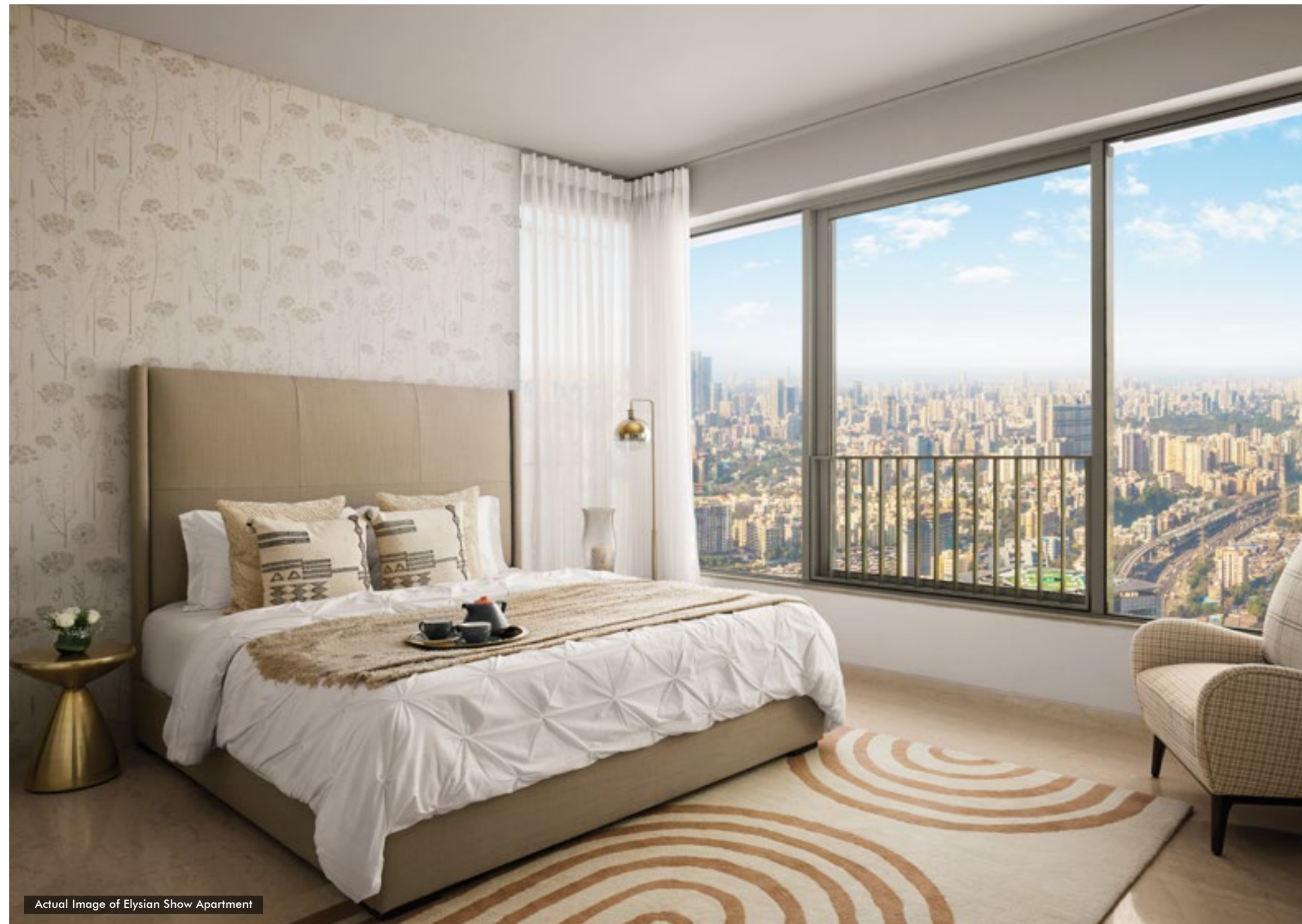
Actual Image of Elysian Show Apartment

There's always room for you to celebrate life's every colour and hue.