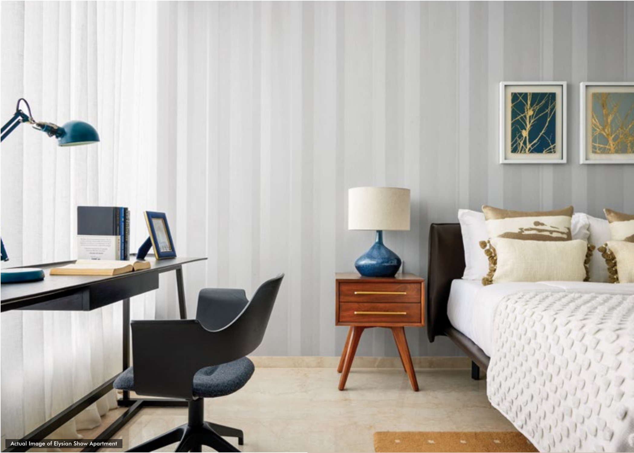
Actual Image of Elysian Show Apartment

Immerse in a world of elegance and sophistication. Apartments in Elysian are rooted in modern design that blends form and function seamlessly.